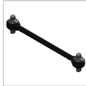
TR59-41008 Torque Rod 20 1/4" AG 200/400/460/690 Kenworth: C65-1009