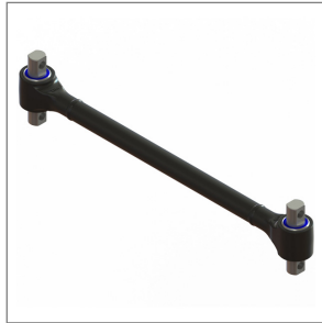
TR46-41002 Torque Rod, Small Eye 24 5/16" FASII | Airliner Freightliner: 16-18972-000