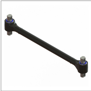
TR00-41009 Torque Rod, Small Eye 25 9/16" AG380 | Flexair | New Low Mount Air Leaf PACCAR: C65-6020