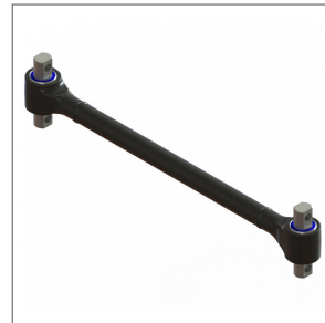
TR75-41440 Torque Rod, Small Eye 17 5/16" Air Trac PACCAR: C65-6026-000010440