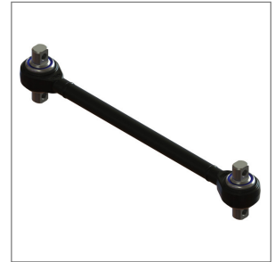
TR59-41474 Torque Rod 19 3/4" AG 200/400 Kenworth: K195-474