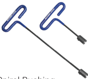
Spiral Bushing T-Handle Install Tool