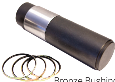
Bronze Bushing & Seal Driver Tool